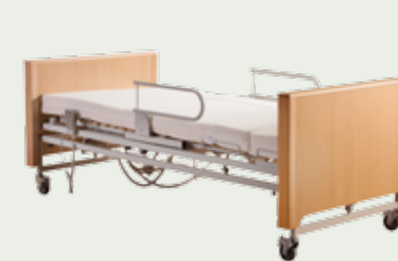
1. Lying position