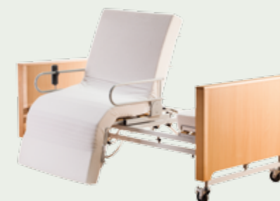
5. Sitting position