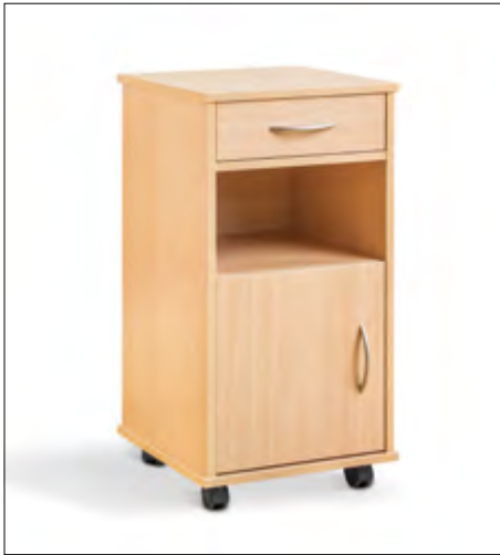
Nightstand Dino 1 The standard deposit