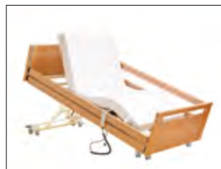
sitting and comfort position

The nursing bed Allegra living is available with covered rolls that give the bed a particularly homely look.