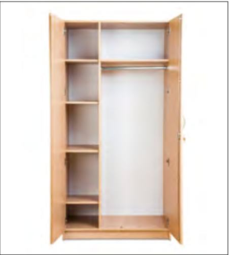
Laundry cabinet and sideboards

A good patient room has furniture such as cabinets, chests of drawers, tables and chairs in addition to a nursing bed. This way, the patient can be given a homely environment with a demand to comfort and dignified living with special needs. The patient rooms can be supplemented with furniture such as cabinets, chests of drawers, chairs and tables to match the nursing bed and its style. Of course, you may contact us at any time if you need to furnish a complete room. We will develop a room concept with the furniture to match individually to your wishes and needs.