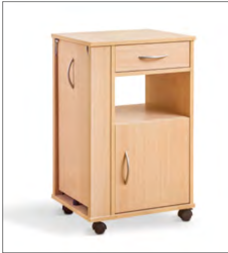
Nightstand Dino 2 The deposit with additional functions

Dimensions: Width 500 mm, depth 400 mm, height 790 mm