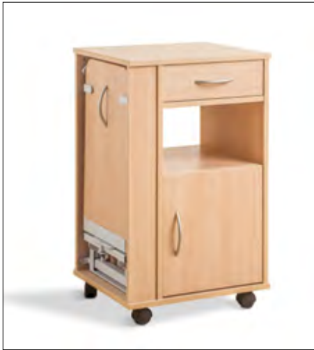
Nightstand Dino 3 The deposit with full equipment

Dimensions of the bed tabletop: 615 x 360 mm