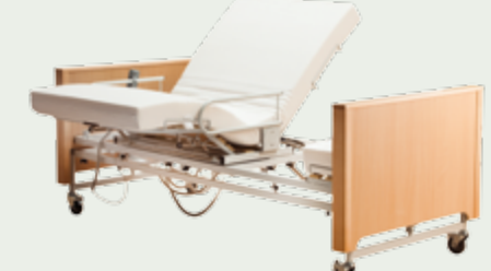
4. Turning the lying surface by 90 degrees