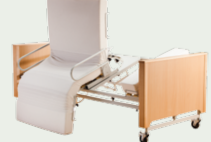
6. Standing position