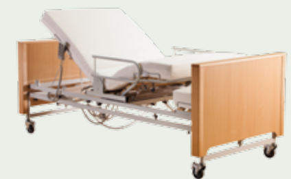
2. Head and foot adjustment