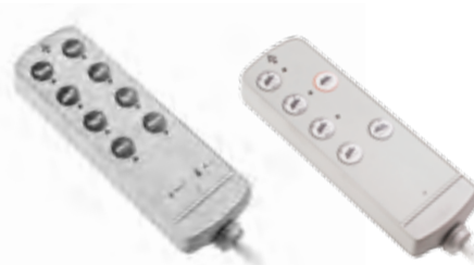
Hand switch lying surface & swivelling