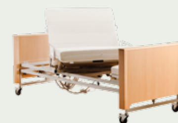
3. Turning the lying surface by 45 degrees