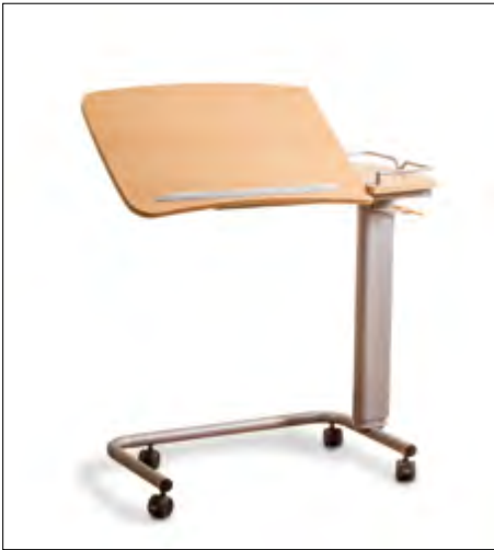
Bedside tables/ server Der elegante Helfer